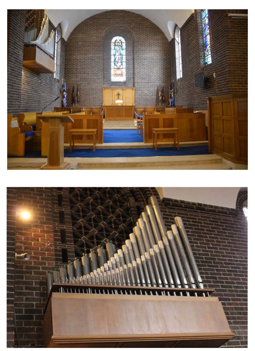
We are celebrating the 50th Anniversary of the installation of our Church organ in February. There will be special services to mark this event.