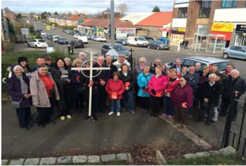
Walk of Witness